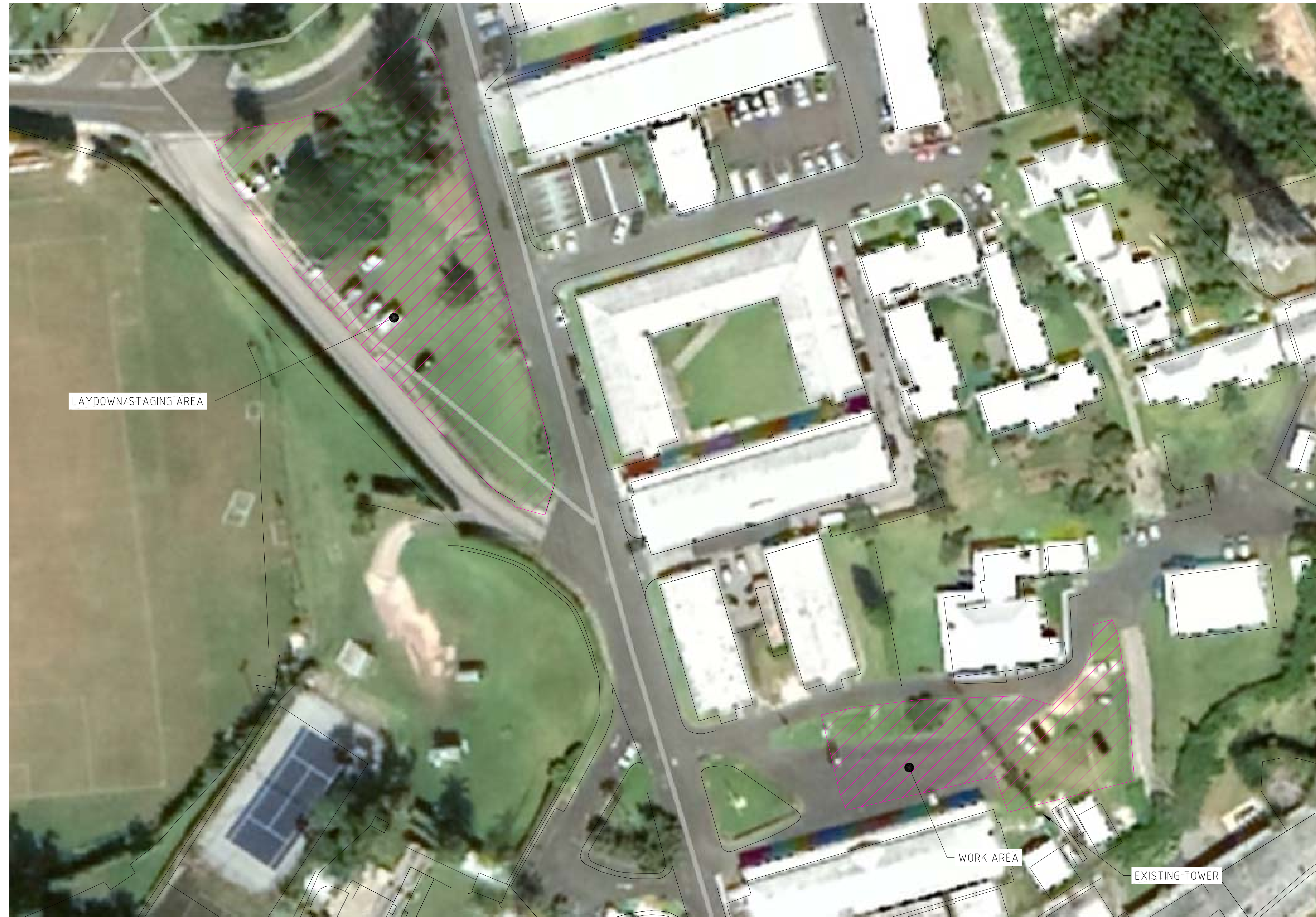
LAYDOWN AREAS 1:400