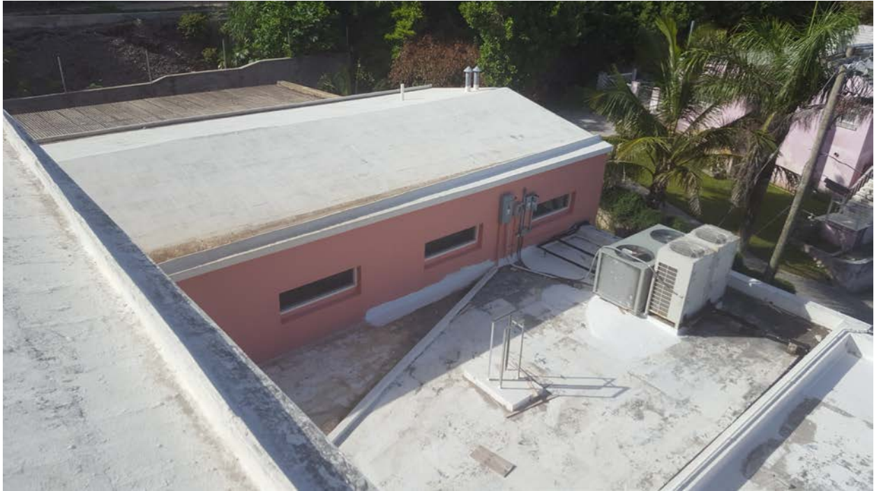
Figure 5 - Assembly Flat Roof & Cafeteria Pitched Roof 1, 6 and 17