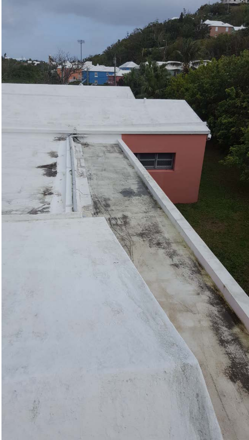
Figure 4 - South East Class Rooms Roofs 7 & 8