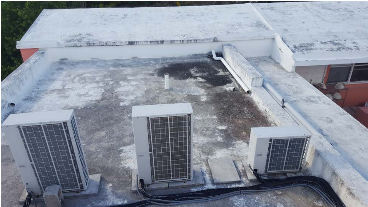
Figure 3 - East Restrooms and Class Room Roofs 4A and 5