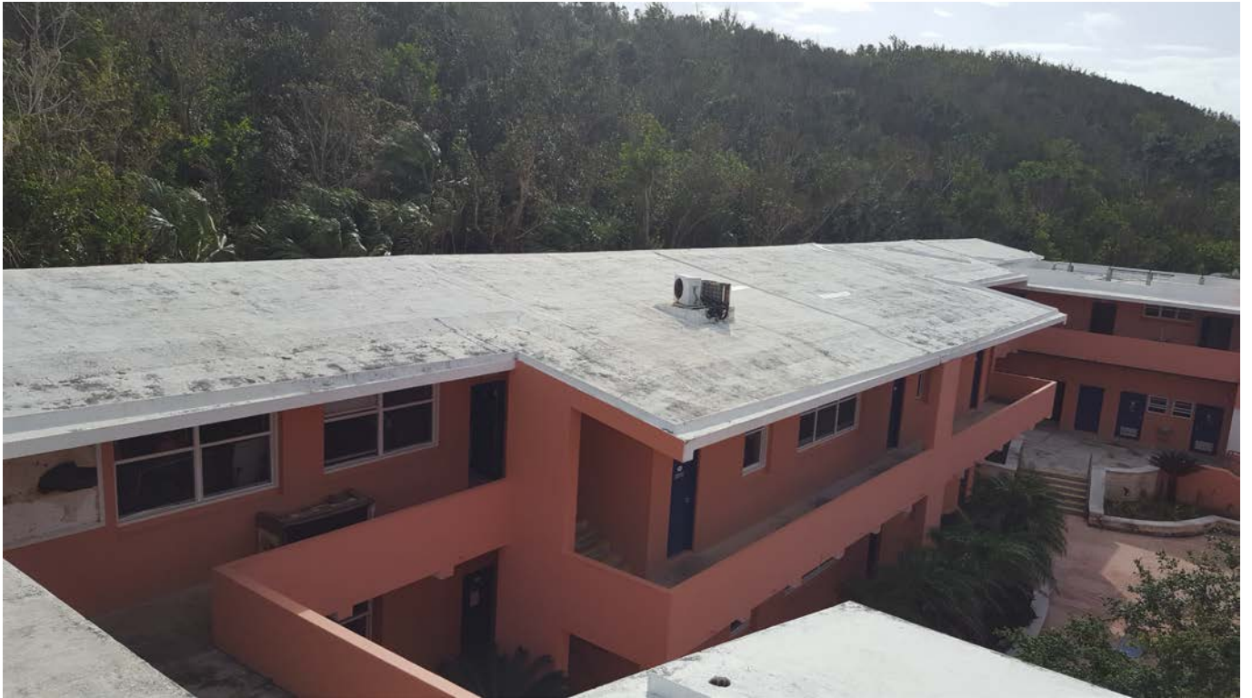
Figure 1 South Class Rooms Pitched Roof 5