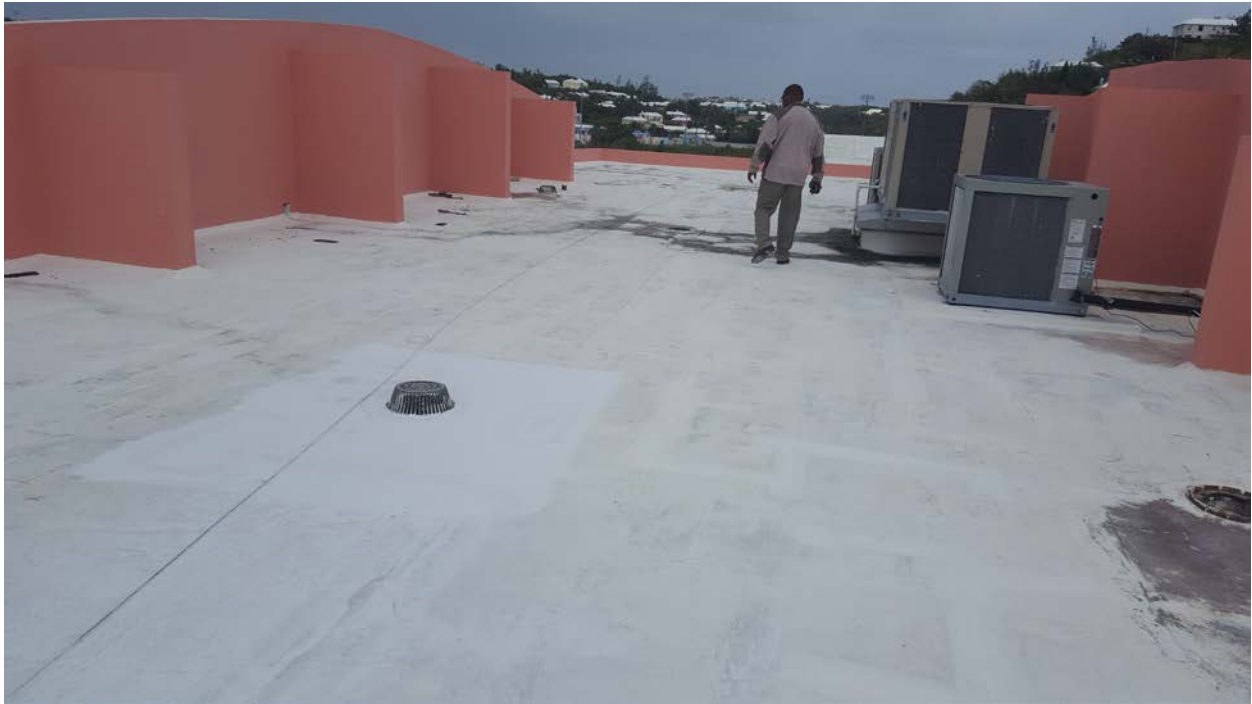
Figure 2 - Library Flat Roof 3