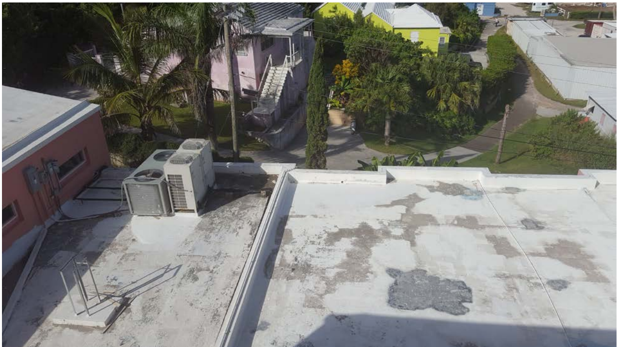
Figure 6 - Assembly Flat Roof 1