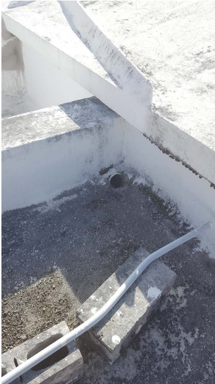
Figure 7 - Flat Restrooms Flat Roof 2A