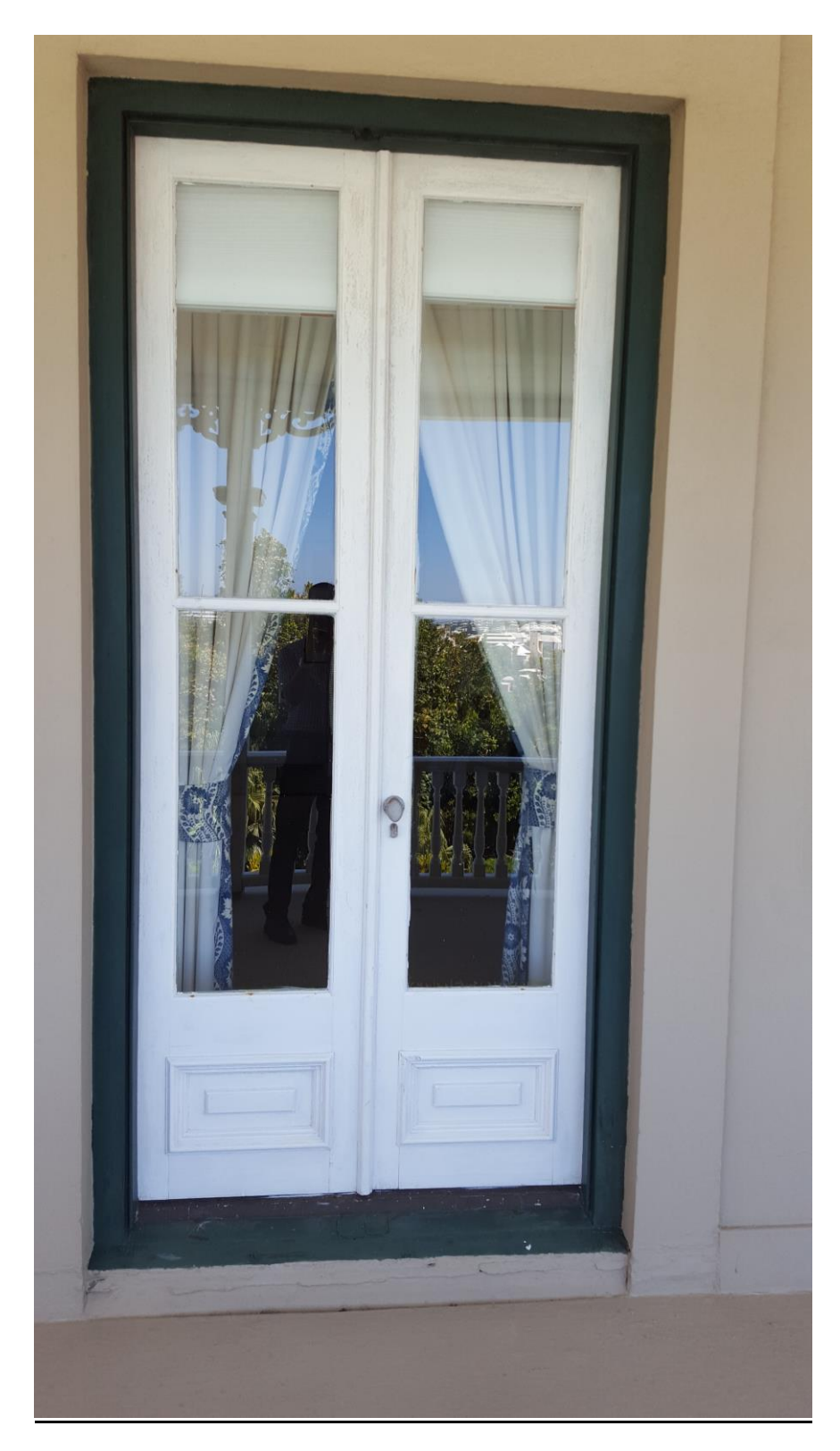
South Verandah French Doors