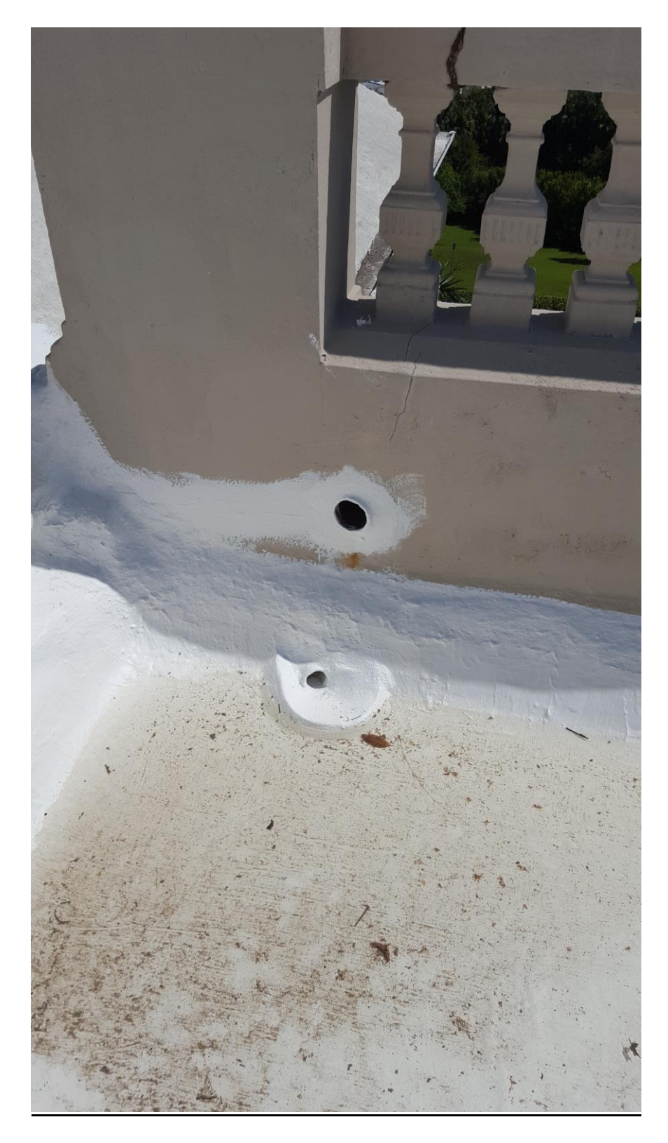
Flat Roof above Main Hallway