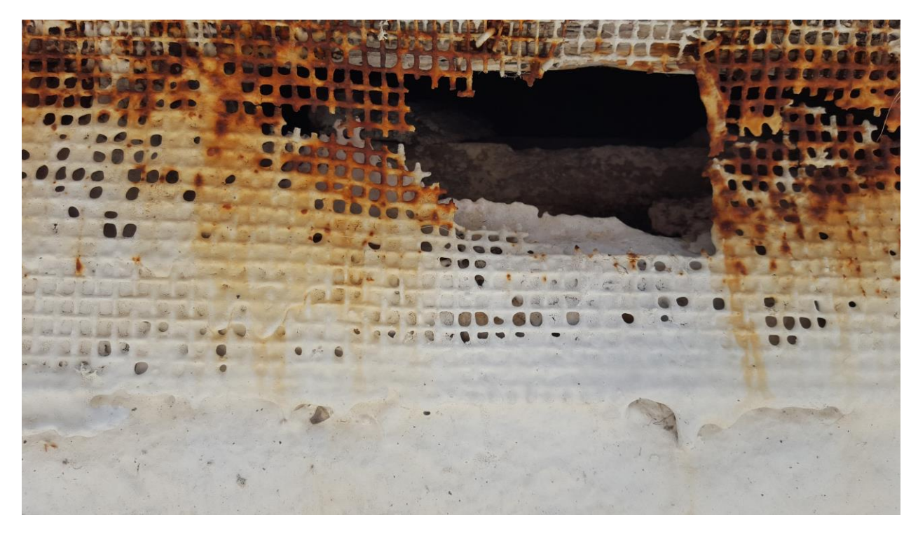
Main Roof Junction with Flat Roof