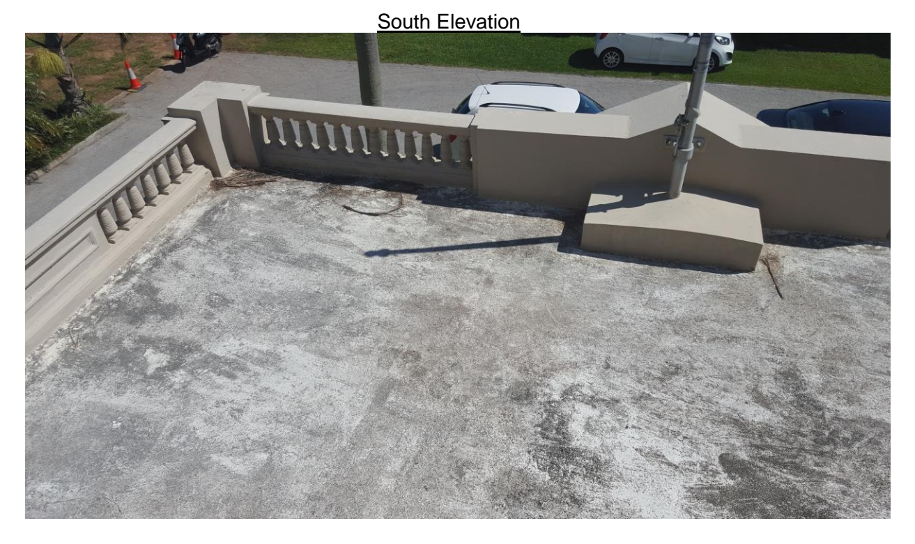
North Flat Roof above Main Entrance