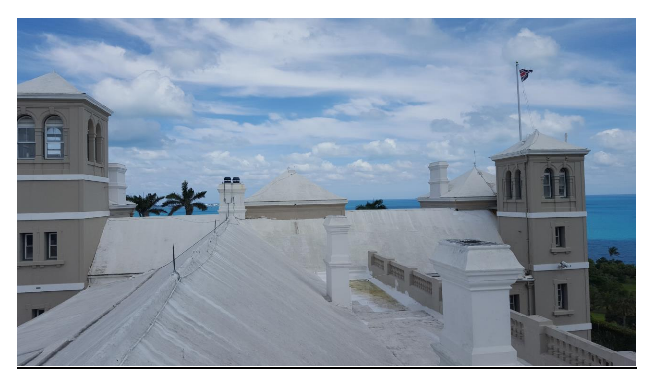
Main Roof West