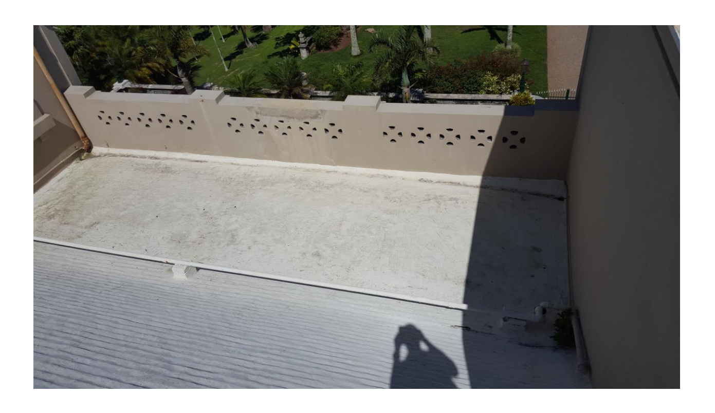
West Flat/Pitched Roof