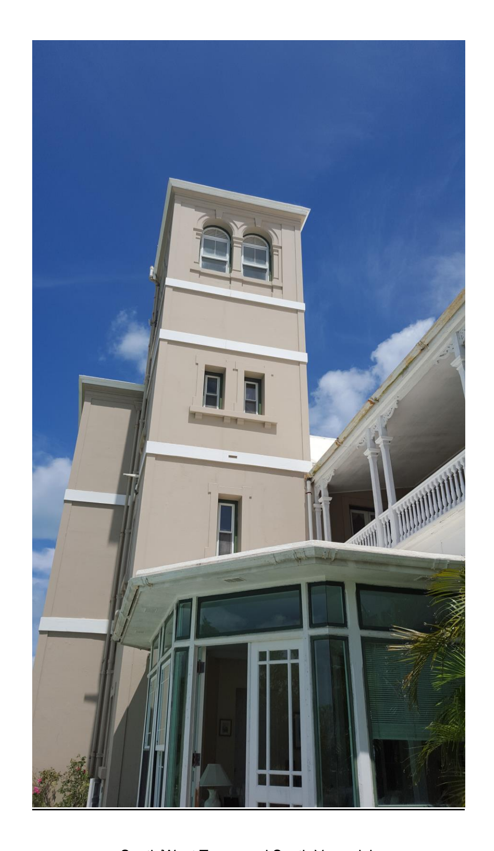
South/West Tower and South Verandah