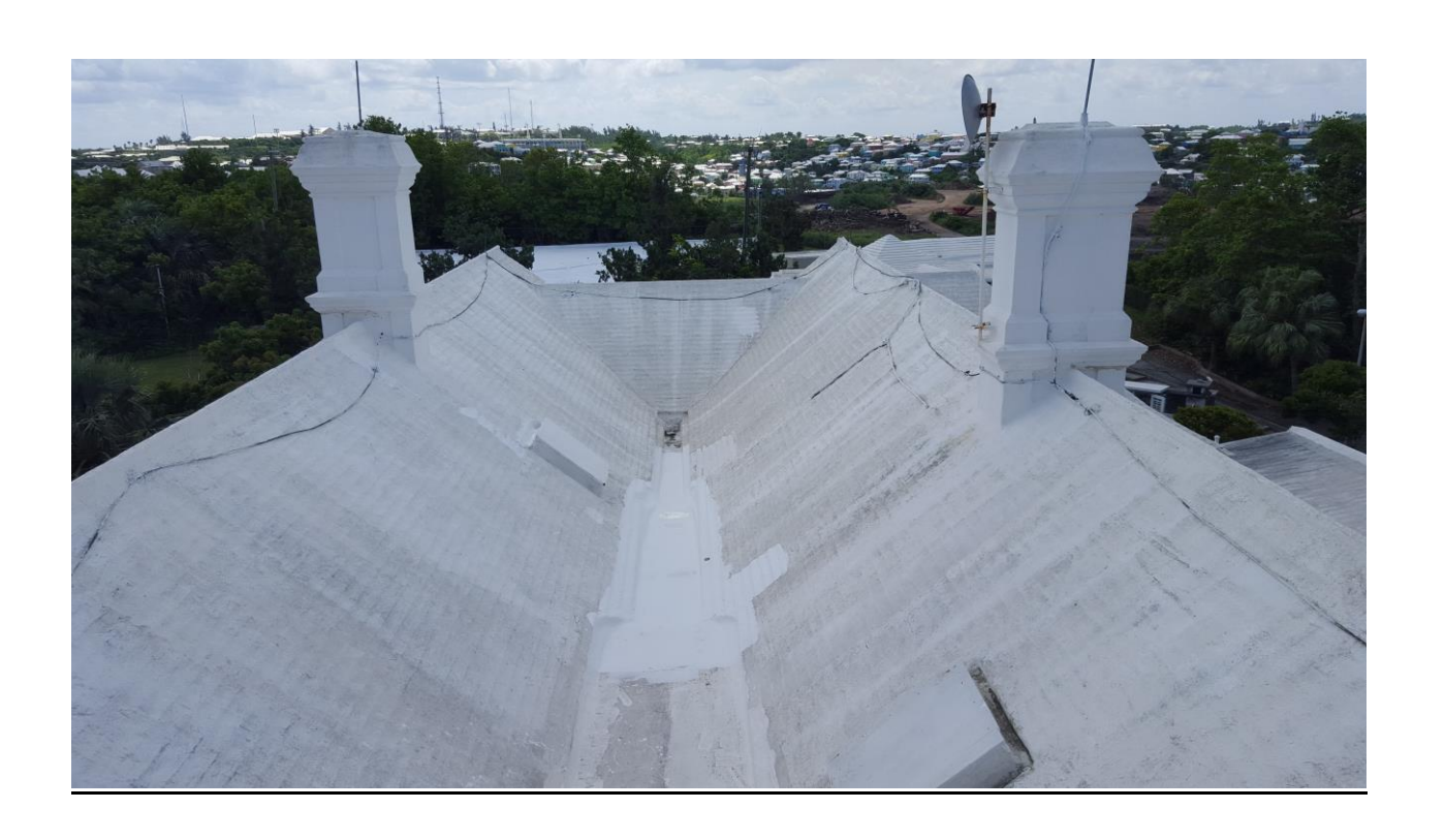
Main Roof East