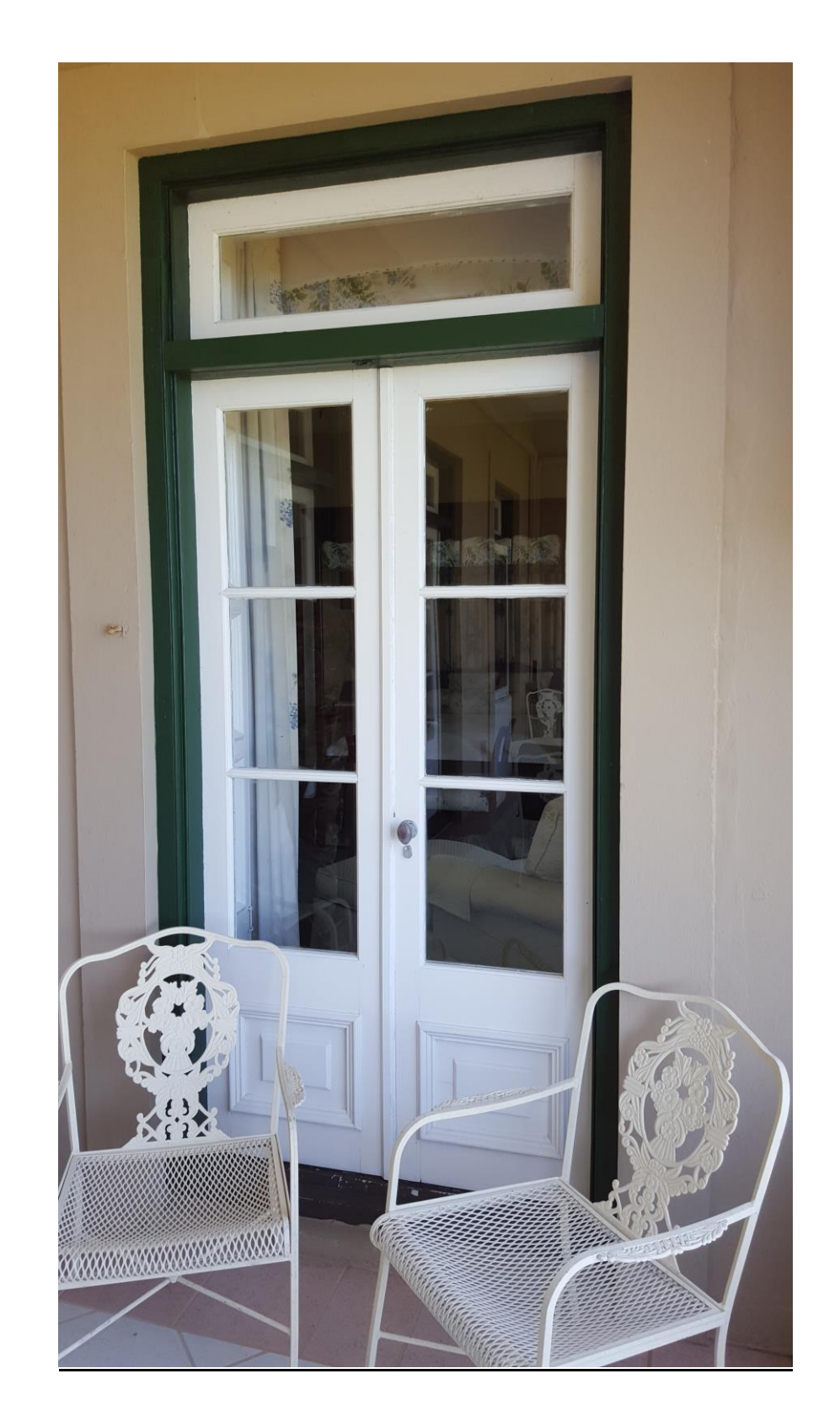
West Elevation Balcony French Doors