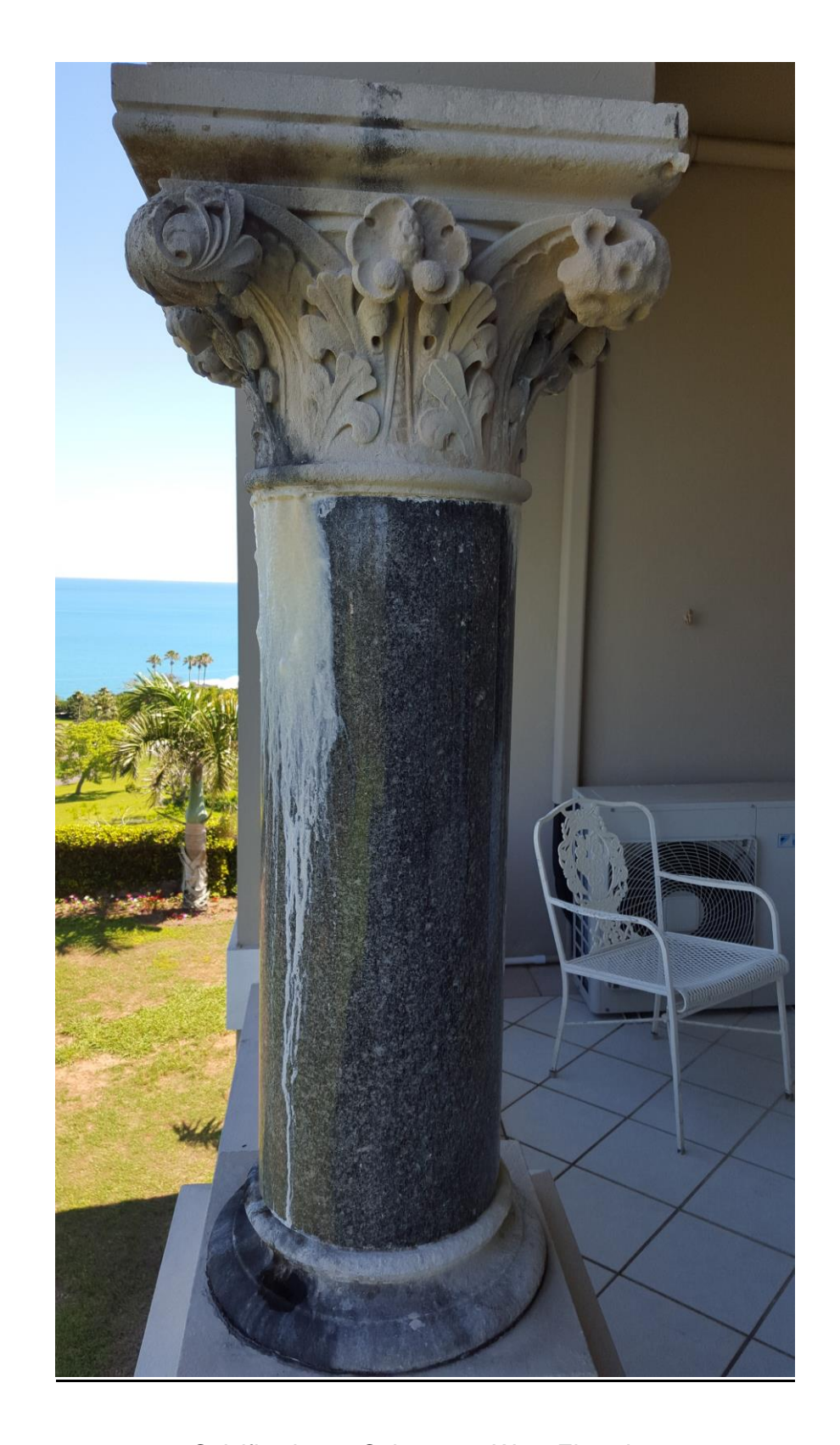
Calcification to Columns to West Elevation