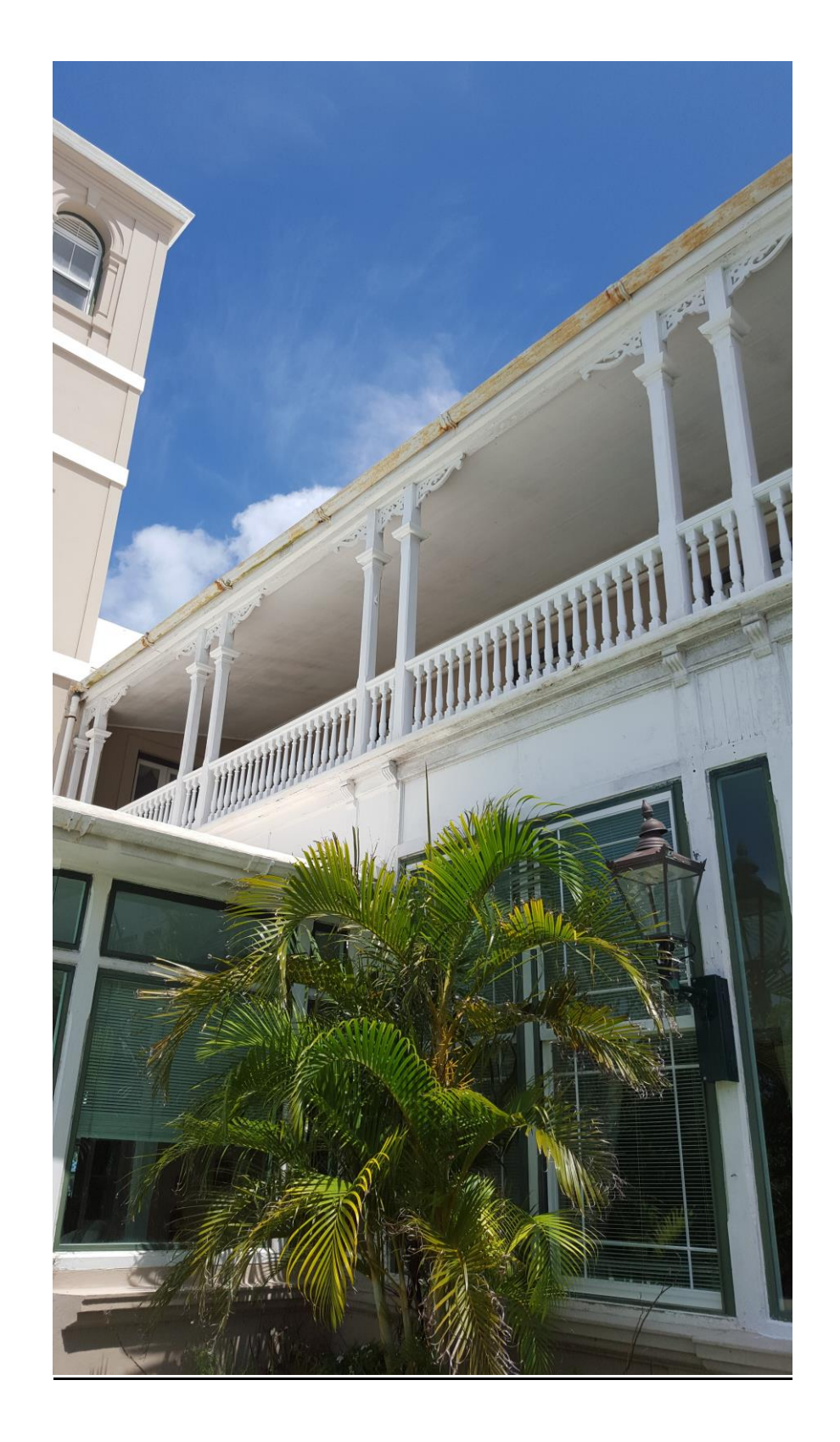
South Verandah and Conservatory