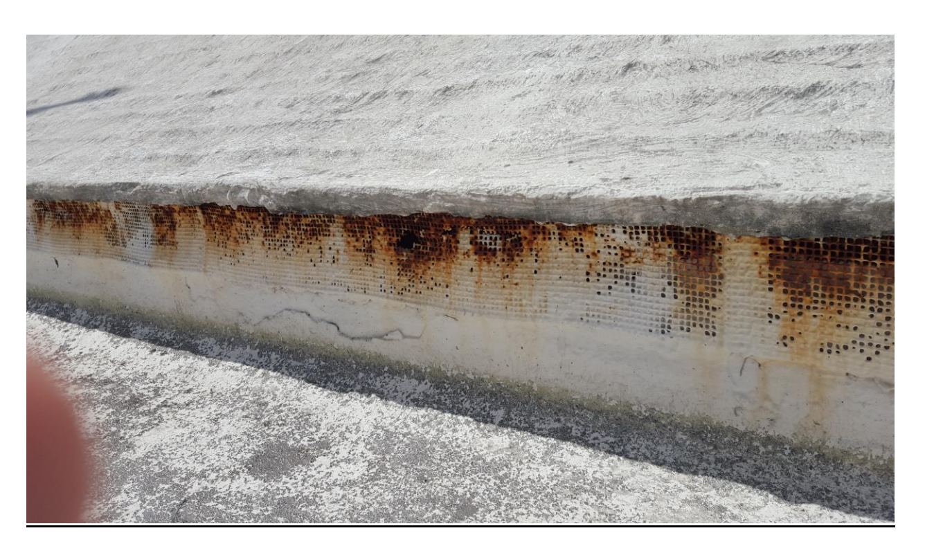
Main Roof Junction with Flat Roof