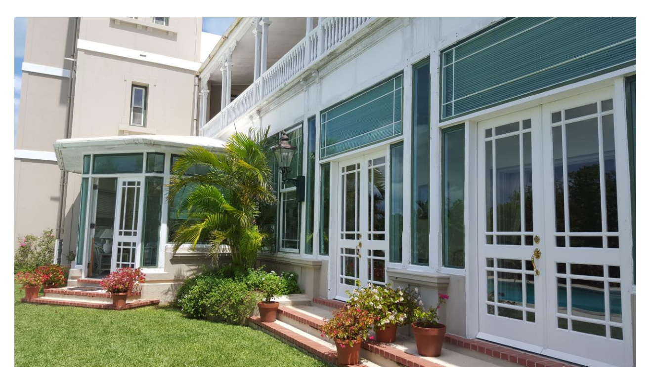
South/West Conservatory and Verandah