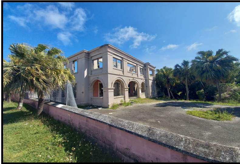
TEUCER HOUSE – 3 CEDAR AVENUE, PEMBROKE