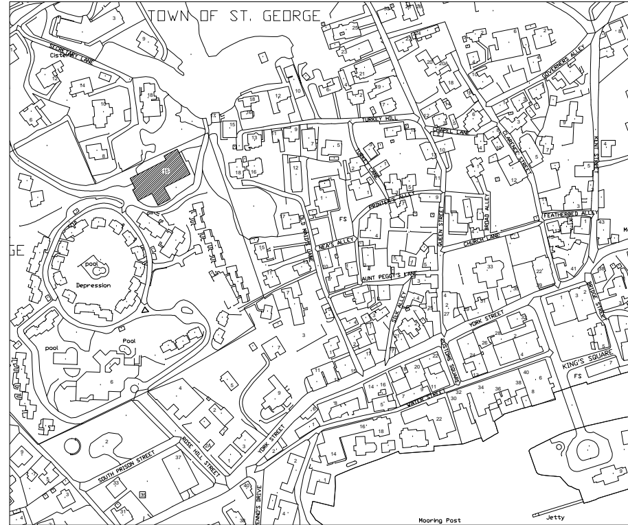
LOCATION PLAN (NTS)