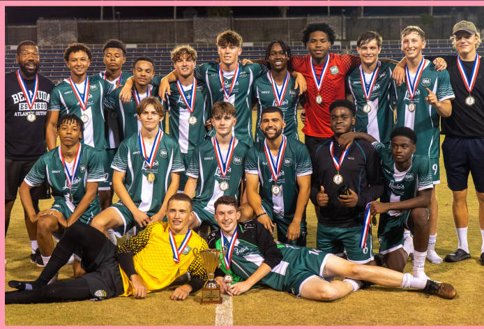
Above: BAA U23 KO Champions Below: SCC Womens KO Champions