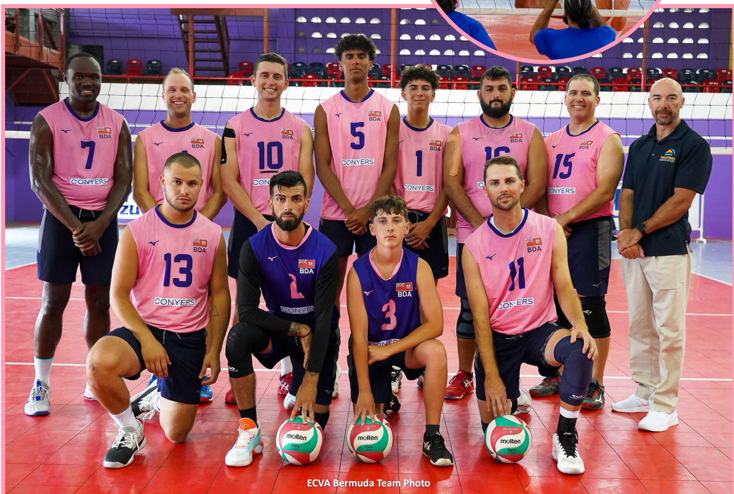
ECVA Bermuda Team Photo