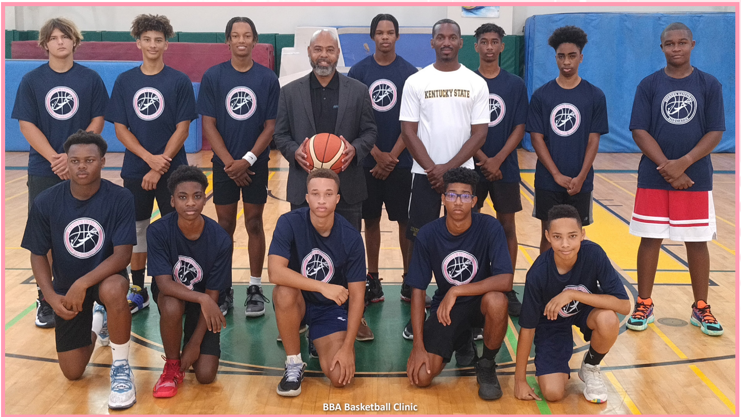
BBA Basketball Clinic