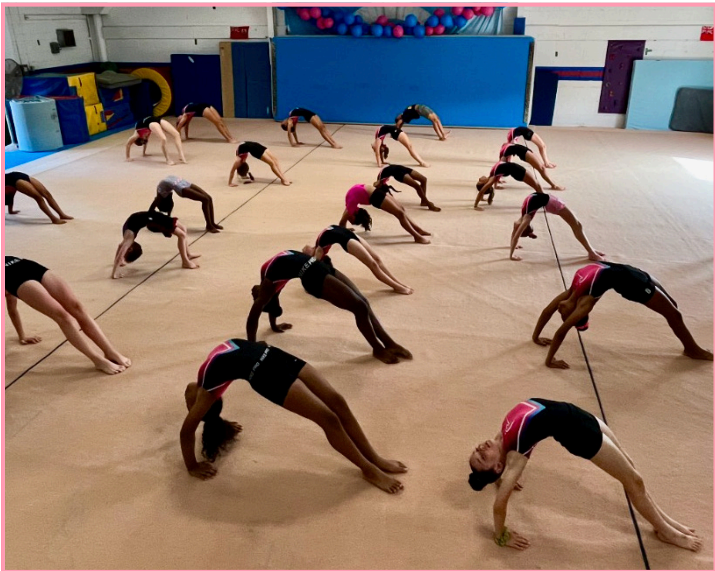
Above: BGA Bridges