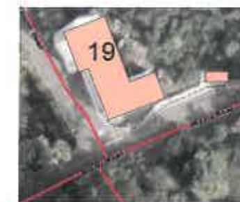
LOCATION MAP: MIDDLE ROAD AT CHAPEL ROAD JUNCTION N.T.S.